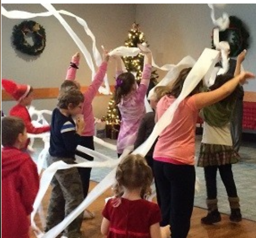
Above: Children at end of Christmas Party Magic Show.